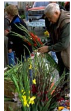
Downtown Farmer's Market

The Downtown is host to most of Barrie's cultural, civic and ceremonial facilities including the courthouse, City Hall, library, Downtown Community Theatre, MacLaren Arts Centre, cenotaph and the Farmer's Market. This is the locale of most of Barrie's festivals and events and includes