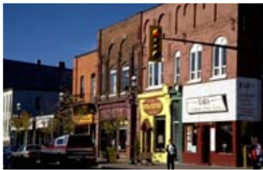
Dunlop Street East

a concentration of restaurants, bars, retail shops, entertainment opportunities. The neighbourhood is wrapped around a large section of the waterfront parkland, which offers visitors some of the best views of Kempenfelt Bay.