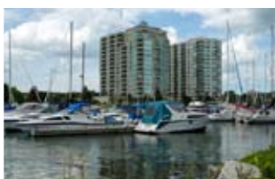
Downtown Waterfront

With an eclectic mix of old and new built form, the Downtown neighbourhood serves a wide variety of users both day and night. It offers a range of services for residents in need, including those found at the David Busby Centre, Salvation Army and the