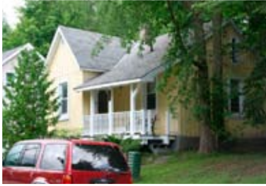
147 Owen Street

The Grove neighbourhood has two public schools—Oakley Park Public School and Barrie North Collegiate—and is immediately adjacent to the Barrie