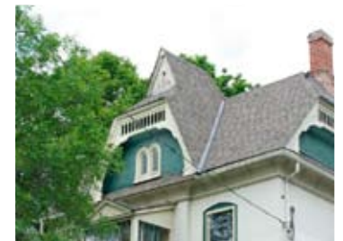
The Kennedy House (c 1882)

The architecture found in many of these mid-to-late 19 th and early 20 th century homes in The Grove neighbourhood is some of the most variable in the City and includes Gothic Revival, American, Edwardian and Georgian styles, as well as blends of many of these traditional styles.