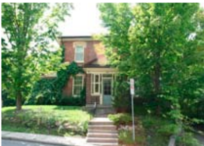
22 Peel Street (c 1870s)

A linear, grid street pattern is found throughout the oldest parts of The Grove, which contains some of Barrie’s original residential streets including Peel, Owen, Clapperton, Drury, Berczy and Davidson streets.