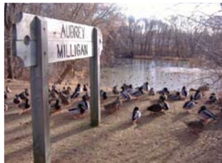
Audrey Milligan Pond

Two sources were invaluable in preparing these profiles — Heritage Barrie Walking Tours and Beautiful Barrie, The City and its People by Su Murdoch, et al (2005).