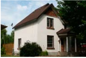
14 Boys Street

West Village residents are in close proximity to the waterfront for recreational and leisure activities.