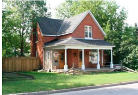
91 Henry Street